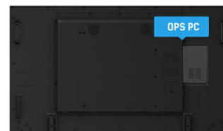
OPS PC SLOT

IPS displays are best known for wide viewing angles and natural, highly accurate colours. They are especially suited for colour-critical applications.